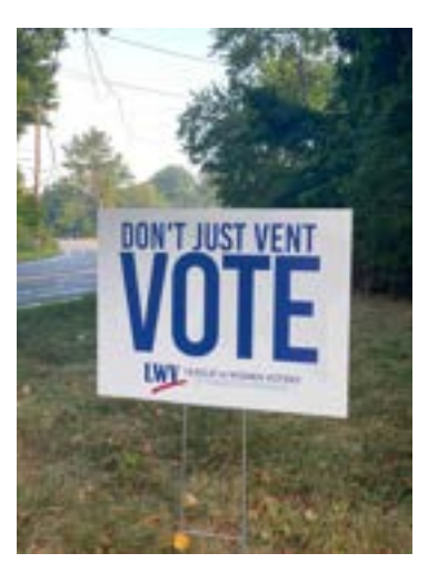
Durable sign, heavy duty stake Order yours HERE!

Primary turnout numbers If you are <u>following us on Facebook</u>, you already know the scoop from our Civic Bytes post, but if not here's what you need to know. Voter turnout was a little under 30% for both Hamilton and Wenham - about the same as prior elections. More votes means better policies and more resources from our elected officials, so we will be focused on improving turnout numbers for November! Make a plan to vote and encourage friends and family to do the same.