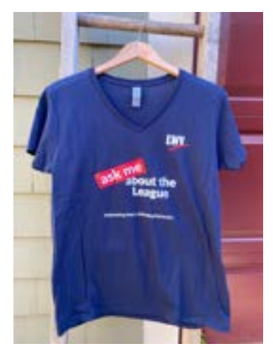
100% cotton, S-2XL Order yours HERE!

Encourage civic engagement! We have snazzy new LWV t-shirts and lawn signs available for purchase. All proceeds support our work empowering voters in our community, and priced at just $20 each, they are an easy way to show your support and invite others to engage! Click through to order yours today or stop by our booth at the <u>Local HW Fall Festival</u>.