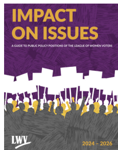
Impact on Issues: A Guide to the Public Policy Positions of the League of Women Voters

We welcome the participation of all members as we regroup. This is a chance to bring fresh ideas and perspectives to the table. Steering Committee members found the following two publications useful in our visioning: