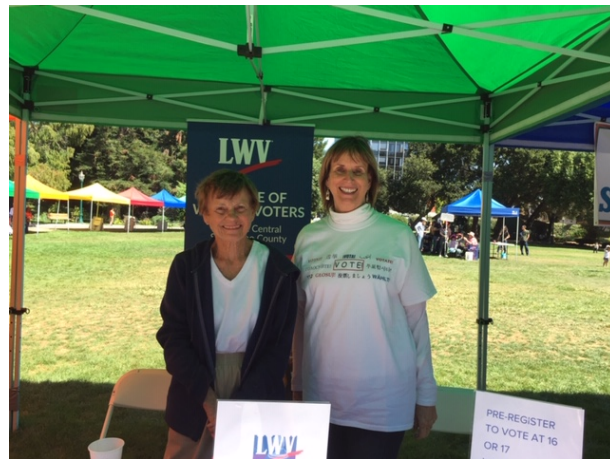
Autumn Moon Festival Voter Registration