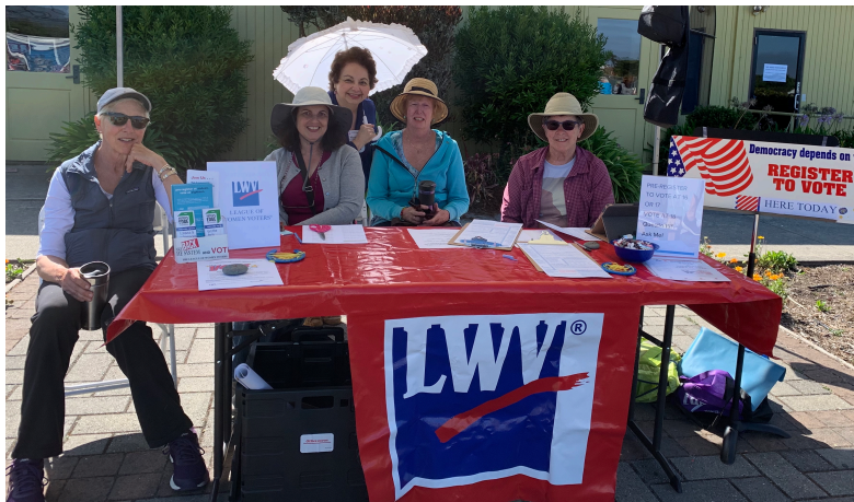
Half Moon Bay Voter Registration Event

True or False: One vote... made the United States an English-speaking country.