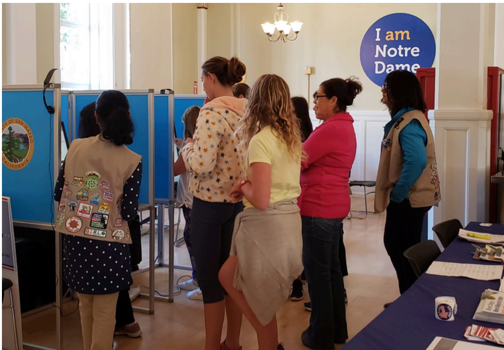
Girl Scouts Testing the Voting Machines