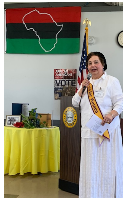
Marta: African Americans and the Vote Celebration