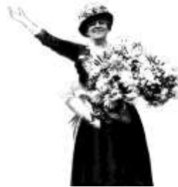
Carrie Chapman Catt