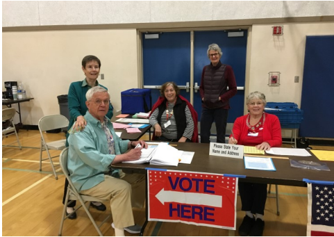
SLO League Members in Morro Bay