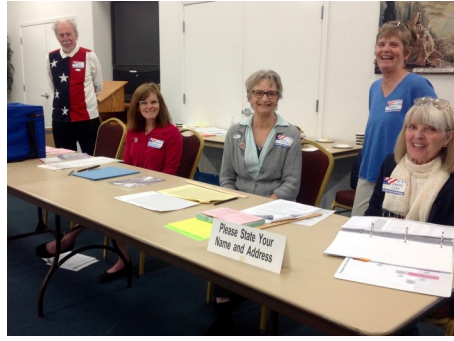
Arroyo Grande Workers at the Polls