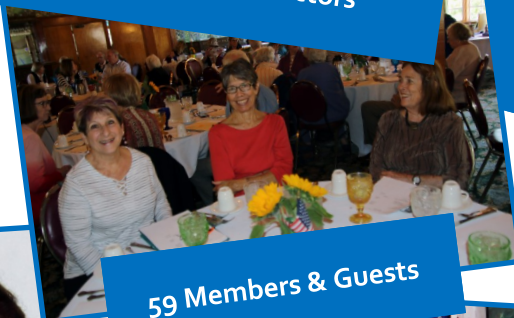
59 Members & Guests