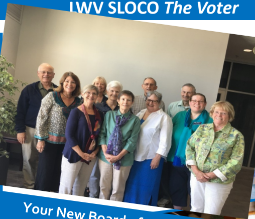
Your New Board of Directors