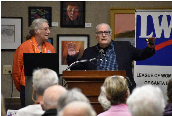
“Pros & Cons Forum” for Ballot Measures