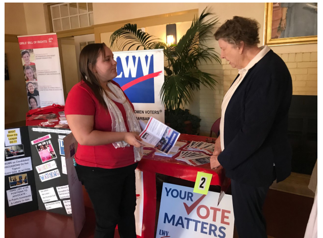
LWVSB at Women’s Summit S.B. Nov. 9,2018