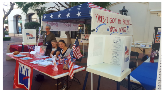
Pop-up Paseo Nuevo, Sunday before Election Day