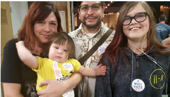
I WILL VOTE TOO - When I’m 18!