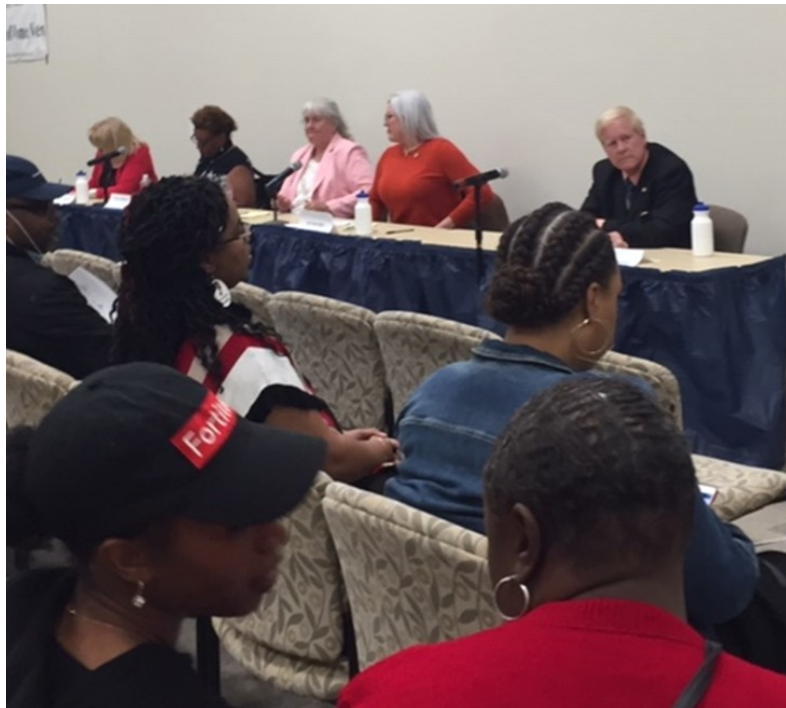
"All Vallejo" Forum Districts 1 and 2

Our League sponsored three successful public forums showcasing candidates for Supervisor in Districts 1, 2 and 5 including a co-sponsored "All Vallejo" Forum with the Vallejo Alumnae Chapter of Delta Sigma Theta Sorority and a forum in Benicia for District 2 with the Vallejo AAUW.