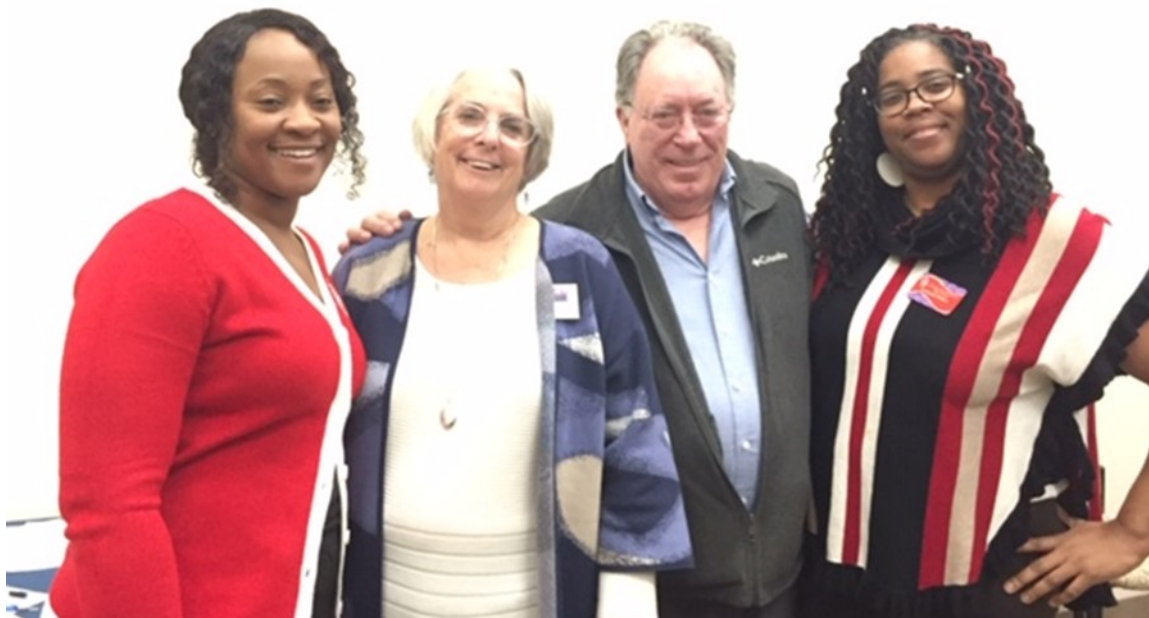
"All Vallejo" Forum Co-sponsors: Vallejo Alumnae Chapter of Delta Sigma Theta Sorority and LWV Solano