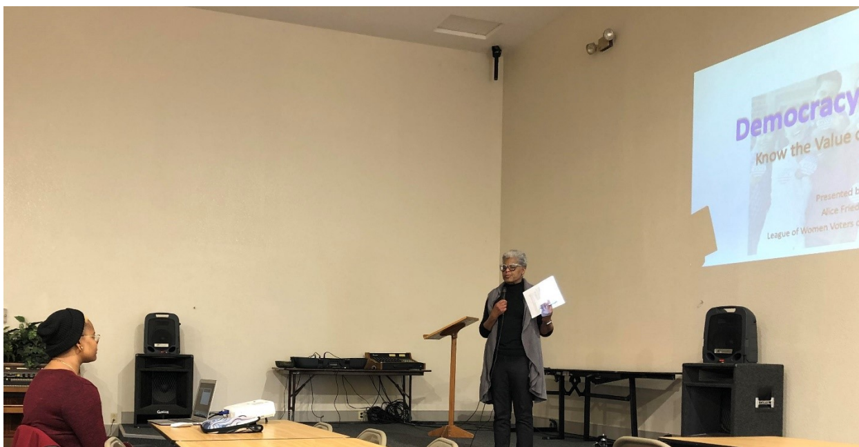
Democracy Matters: Know the Value of Your Vote Fairfield, Bethel Community Church