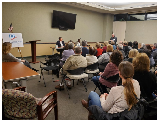
District 5 Vacaville Forum