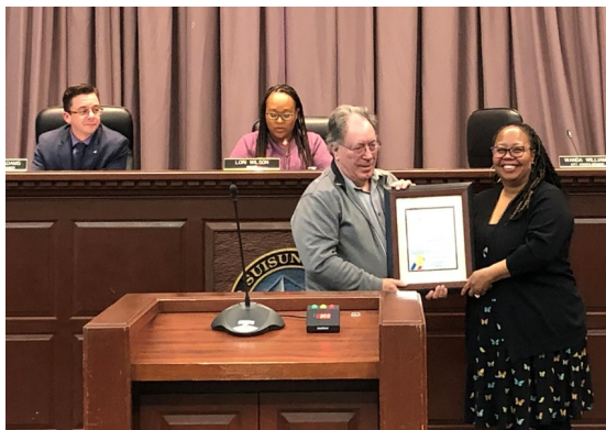
Suisun City Proclamation