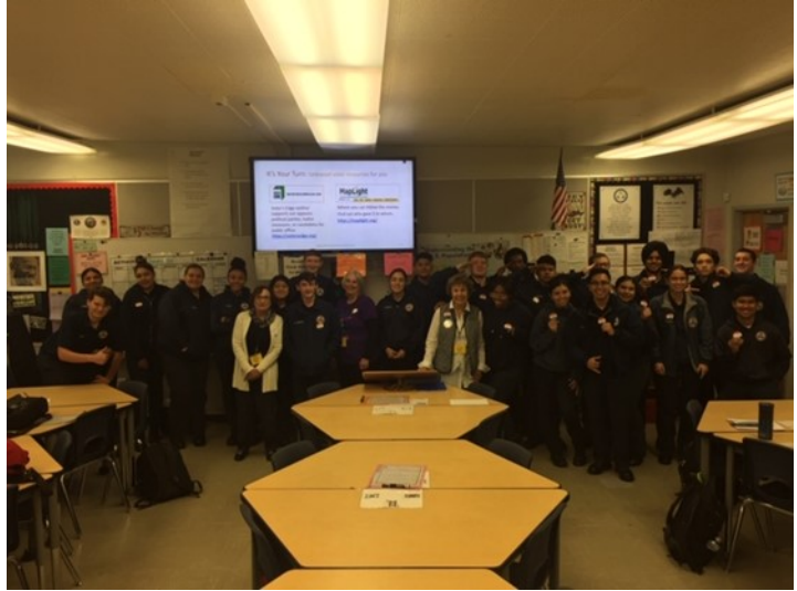
Youth Registration at Public Safety Academy, Fairfield

Thank you too to those of you who helped on the spur of the moment, setting up chairs, cleaning up, and bringing food or materials. Please know that if you helped and aren't on the list below, your work was appreciated, and I just don't have all my lists of helpers from 11 schools, 3 forums, and the texting parties all organized at the time of this writing.