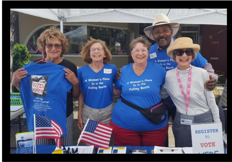
Models wearing their Centennial T-Shirts at the SR Wednesday Night Market

As many of you know in 2020 we are celebrating the 100th birthday of the League and the 100th anniversary of ratification of the 19th amendment, which recognized Women's Right to Vote. To let the community know about these important events we are inviting you all to purchase and wear our new Centennial T-Shirts ($20 including tax). The color is LWV royal blue.