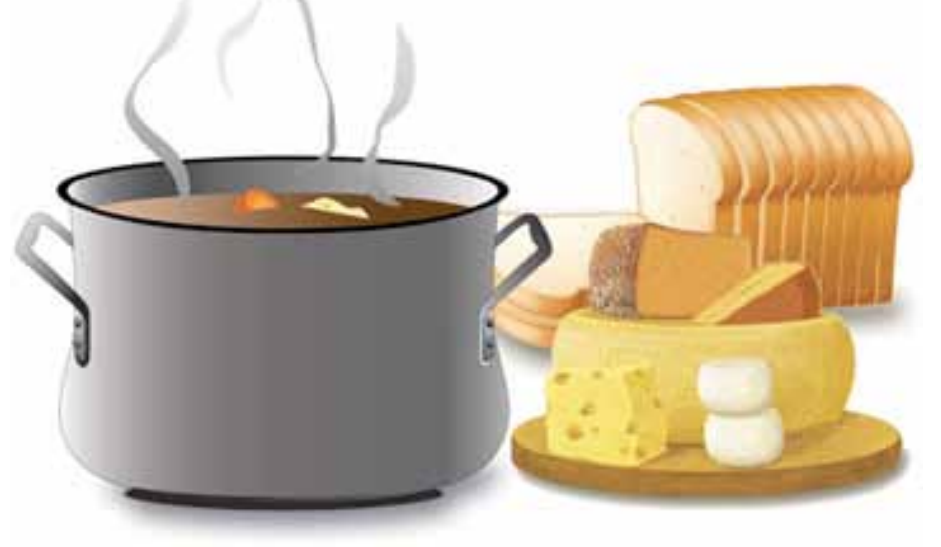
Go to Page 4 for Further Details.

What Political Issues Should Our League Study at the Local, County, Bay Area & State Levels?