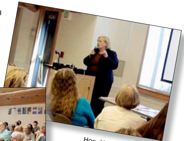
Hon. U.S. Representative Zoe Lofgren