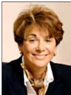
Congresswoman Anna Eshoo