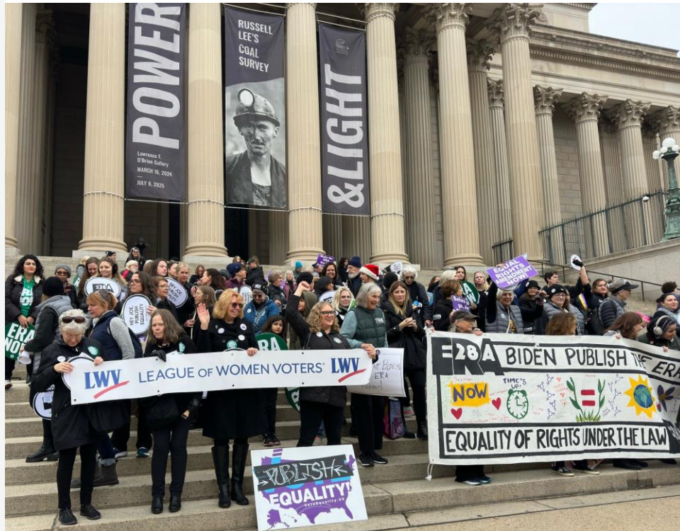
Members of the League of Women Voters were out in force on December 10, demanding that President Biden enroll the ERA into the Constitution now!