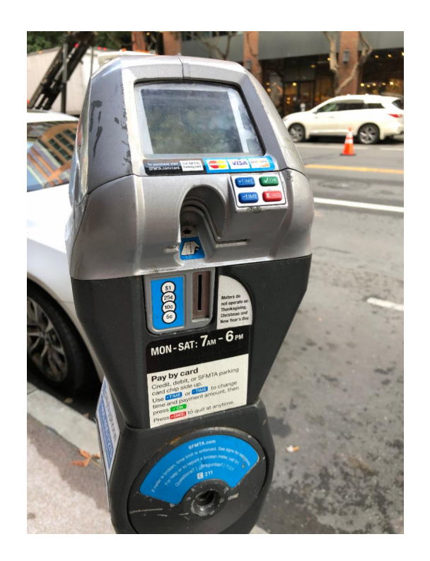
Plenty of Street Parking available with Credit Card