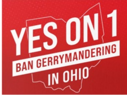
Fair Districts Signs