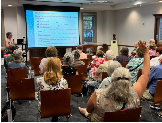
Sept. 12, 2024 LWV of Hudson meeting at the Hudson Library and Historical Society.