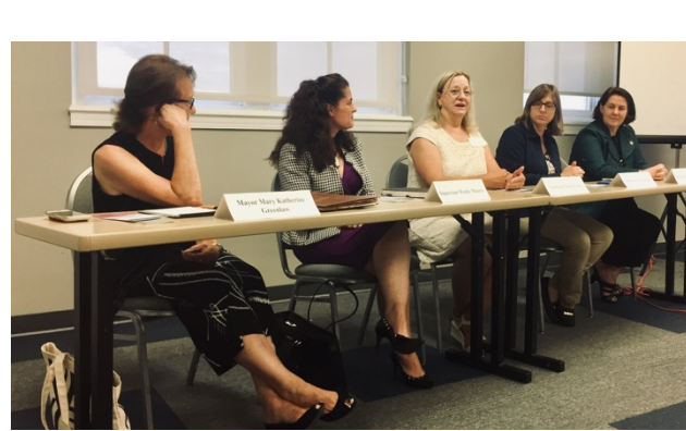
Local elected officials participate in panelist discussion on Women's Equality Day