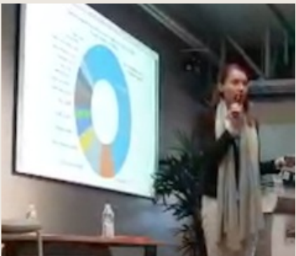
Casey Farmer Alameda County Complete Census slide presentation