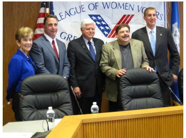
1 st Congressional District debate