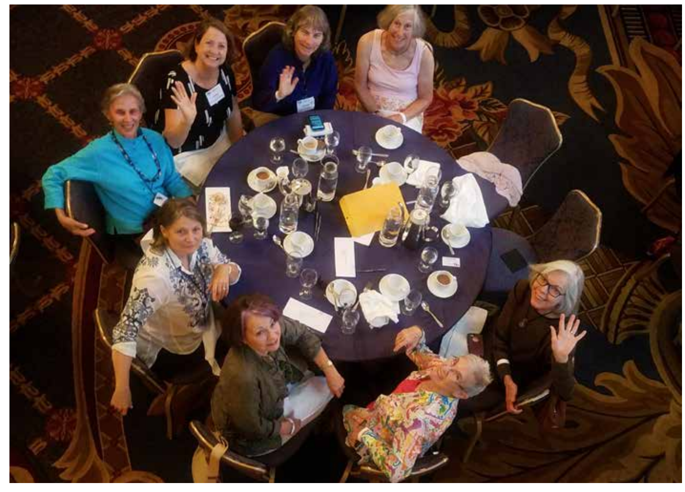
New Mexico delegates gaze upward in the ballroom during the LWVUS Convention banquet.

The Redistricting Caucus was terrific, very useful in