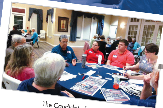
The Candidate Forum