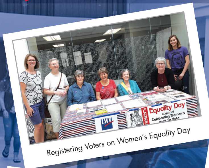
Registering Voters on Women's Equality Day

For information on State Legislative and local races visit www.vote411.org