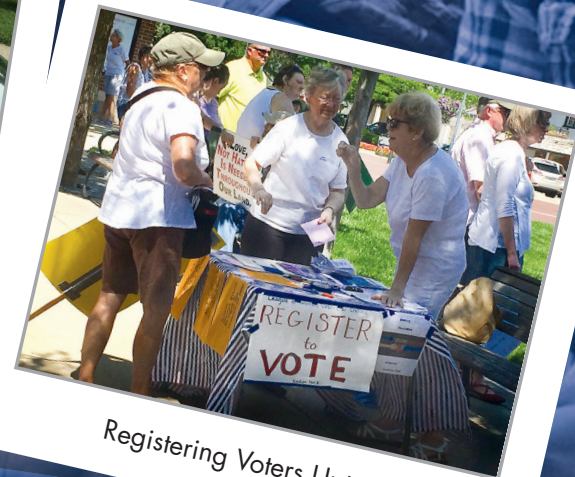
Registering Voters Uptown