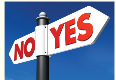
Number of Statewide Initiatives Qualified for the California Ballot