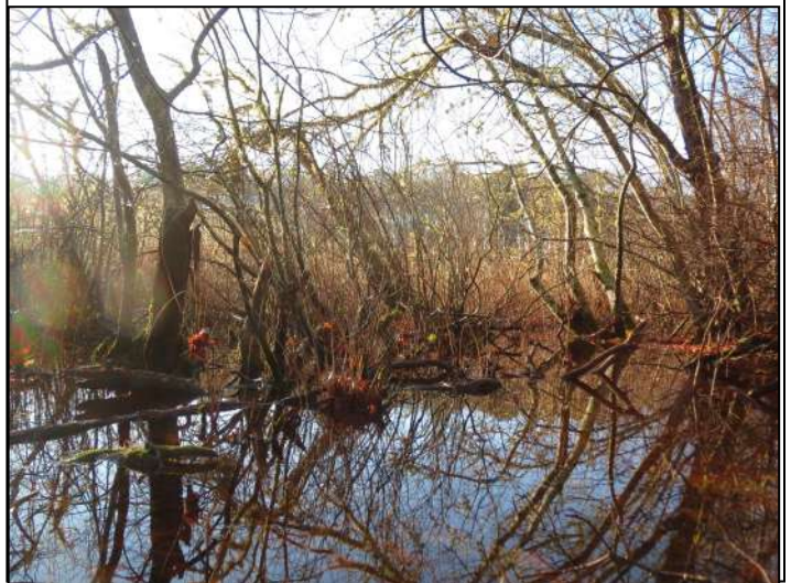
Wetlands at Peterson Farm.

To learn more about the Coonamessett River project, visit the webpage Coonamessett River Trust: Restoring a River at https://www.crivertrust.org/ . For the Peterson Farm, a trail map, slide show, and additional information can be found at https://300committee.org/conservation-lands-2/peterson-farm/ .