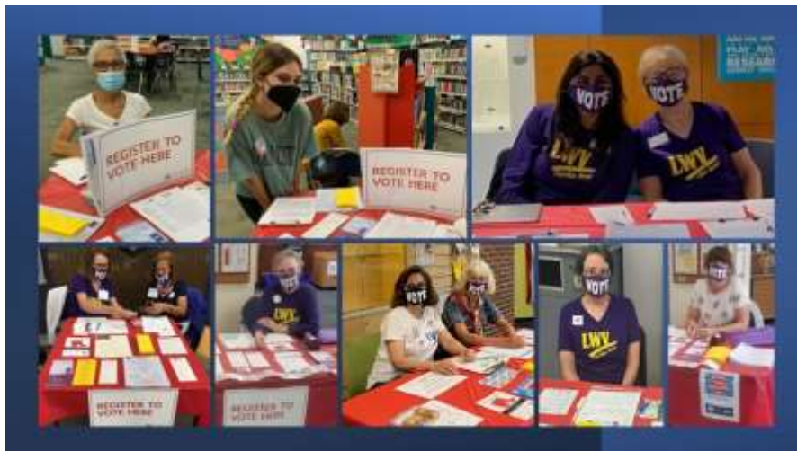
2021 National Voter Registration Day at Libraries in Northern VA

A Liaison to LWVNCA from each member League is appointed by their respective League and they become members of this board. The LWVNCA board will appoint 2 more members to the Nominating Committee.