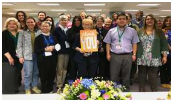
Thank Election Heroes Day of Action, Tuesday, April 12, for Fairfax Registrars

We had a very successful year due to LWVFA members who donated their time and money!