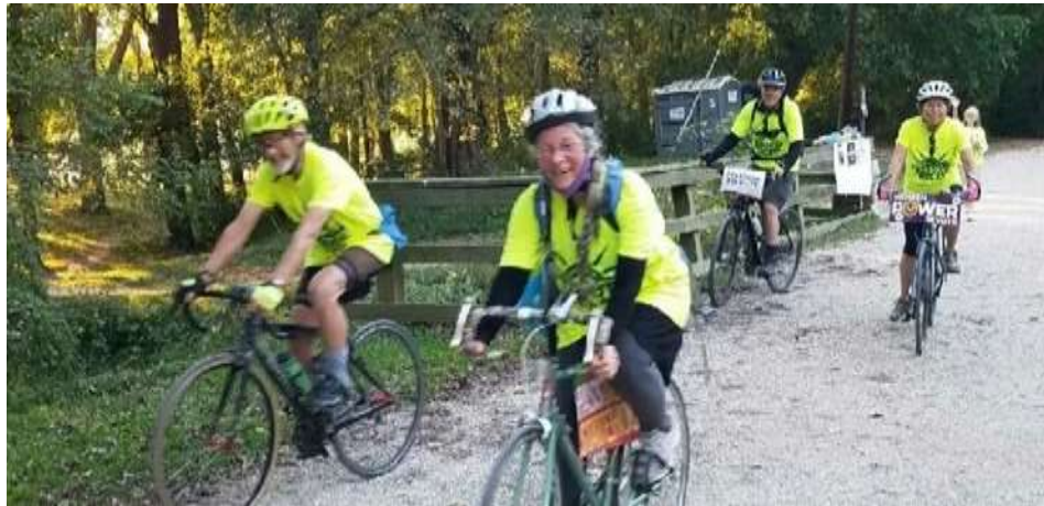
League Bicycle Riders in Freedom to Vote Rally