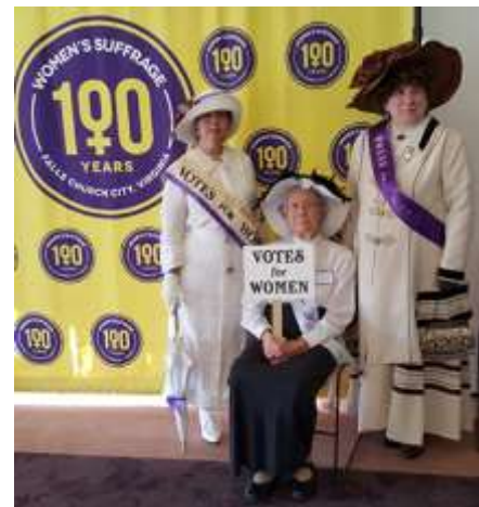
City of Falls Church LWV Suffragists

Membership: Falls Church has 100 members. We also hosted a virtual birthday party in February and a fall membership social. We held the fall membership social outdoors in one of the city parks, and it was the first in-person event since February 2020. We are planning our first in-person Annual meeting since the pandemic began for June 12 th .