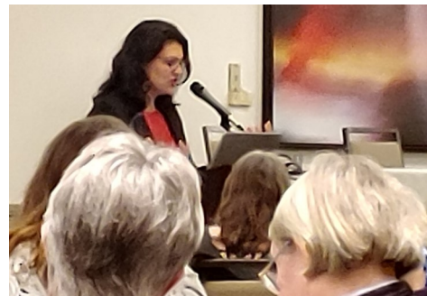
Rashida Tlaib, Congresswoman, from Michigan's 18th District.