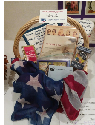
LWV NWW's donation for the State League's auction to raise money for their Education Fund