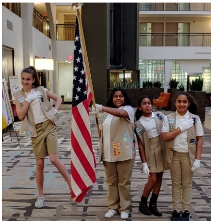
Honor Guard Canton Girl Scout Troop 40900