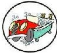
Sco's Southside Auto Bath