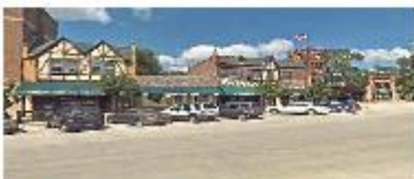
American Eyecare Center