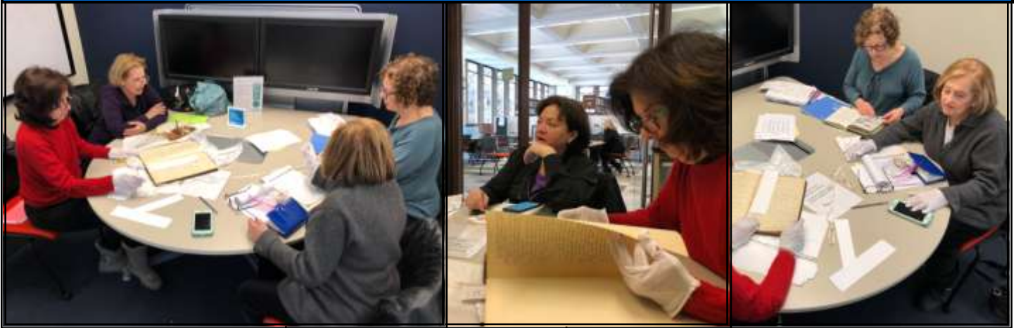
Our materials have been archived at the HP Library! In January we began looking through the archives.