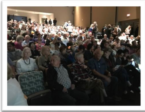
The audience for the Hill-Knight Candidate Forum with another 75-100 in the overflow room

Altogether, we held 14 forums in 14 different communities/neighborhoods starting on September 20, with a record number of 5 forums in four nights September 24-September 27. Our members and friends made up a total of 39 volunteers to help with the forums. We had excellent coverage in local newspapers, on our website and on Facebook thanks to David's press releases and Maria, Betsy, and Chelsea for the help in publicizing the forums. The Star and other local papers ran articles about each of our forums many with photos that featured the candidates and the League's name.