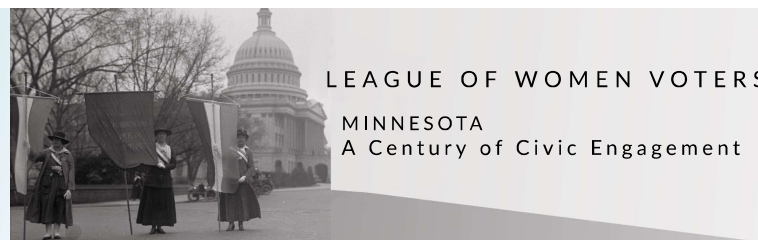
Women's Suffrage Movement, St. Paul MN circa 1918