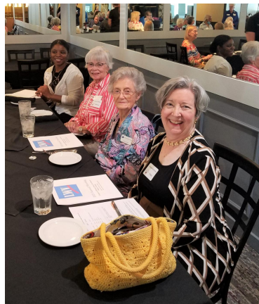
Enjoying each other