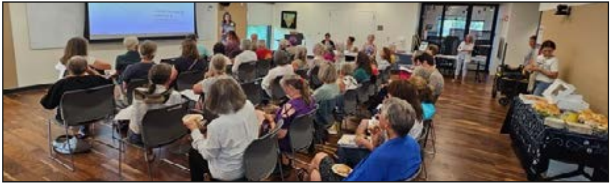
June 10 Immigration committee program — a full house.