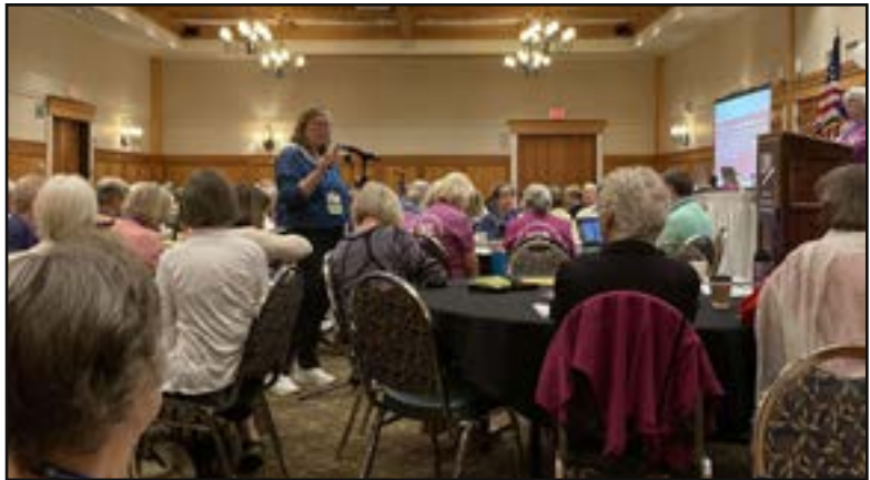
League member participating at the convention.

https://www2.csudh.edu/ccauthen/576f12/frankfurt_harry_-_on_bullshit.pdf