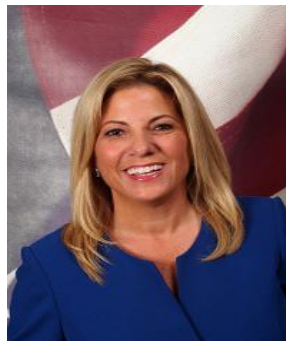
The Hon. Valerie Longhurst

REGISTRATION DEADLINE MONDAY March 22, 2019