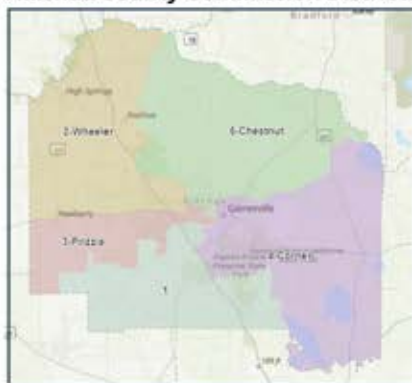
Alachua County Commission Districts

https://www.votealachua.com/Elections/District-Boundaries