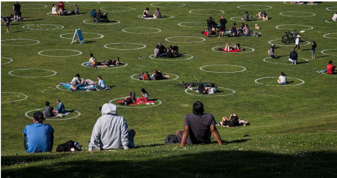
No white circles, but plenty of space to maintain social distance!