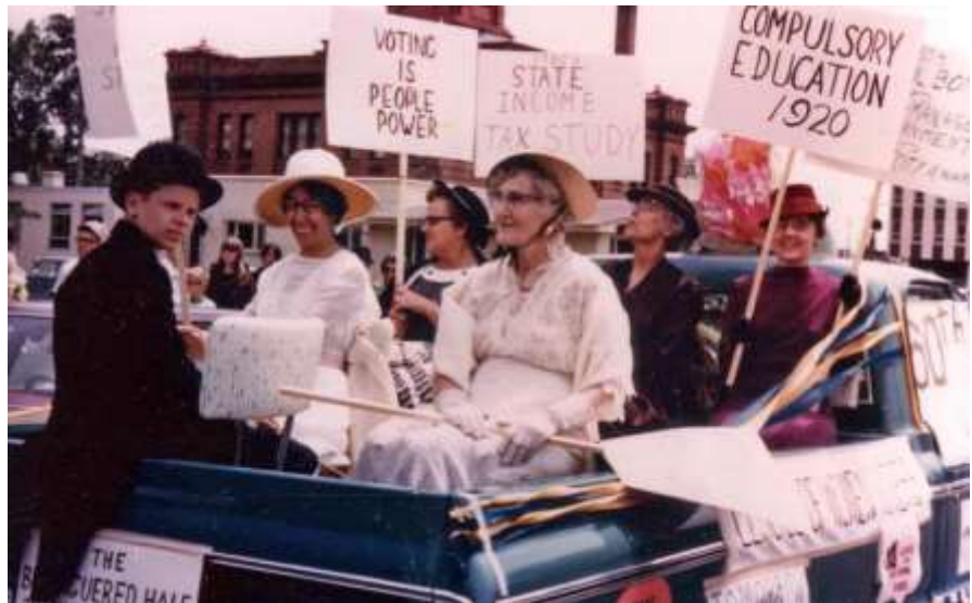
1From Bemidji Pioneer, Oct 3, 2020

This article, in the October 3, 2020 Bemidji Pioneer, documents the role that LWV Bemidji played in Bemidji's civic life 100 years ago. It's an interesting read. Find the article at this link – click here.