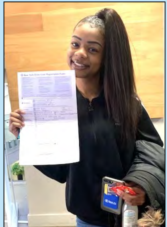
NEW VOTER AT MONROE COLLEGE

Fourteen named plaintiffs – students and parents – filed the class-action lawsuit, Cook (A.C.) v. Raimondo , against Gov. Gina Raimondo and other state officials last year. It argues that Rhode Island violates students' constitutional rights by leaving many of them without key skills and knowledge to exercise such basic civic responsibilities as voting or jury duty. --Christian Science Monitor MORE AT CIVICS