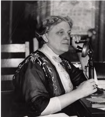
Carrie Chapman Catt

Carrie Chapman Catt dedicated her life to campaigning for woman's suffrage both in the United States and abroad. In addition to being president of the National American Woman Suffrage Association at the time of the passage of the 19th Amendment, she published a book about the suffrage movement, and founded the National Committee on the Cause and Cure of War. She also conceived of and founded the League of Women Voters, and worked tirelessly for world peace, encouraging the United States to first become part of the League of Nations and later to be part of the United Nations.