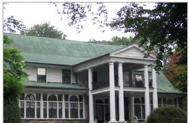
Catt's New Rochelle home

--adapted from Westchester County Historical Society