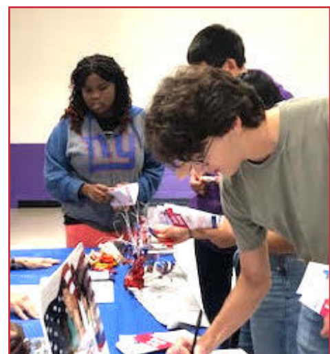
NRHS Honors' Society students

In October, Voter Guides to the candidates will be distributed before the election. Go to Vote411.org for the live digital version of the guide. Vote411.org is now LIVE! Try it here . On October 21st, the LWVNR will sponsor a Candidates Forum at City Hall to meet the candidates running for Mayor, County Legislator, and City Council.