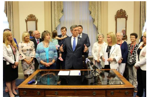
Governor Carney is signing HB 38 which allows for early voting bill. He is surrounded by legislators and election reform advocates.

HB 73 is the first “leg” of a Constitutional amendment that would eliminate restrictions on absentee voting. It passed the House with only three negative votes but in the Senate, it failed to receive the two Republican votes needed. Recognizing the inability to get the needed votes, Sen. Bryan Townsend voted no, which gives him the ability to bring the bill up again in 2020 to try again to meet the two thirds majority required for constitutional amendments. It would then need to be passed again in the next Session in 2021-22.