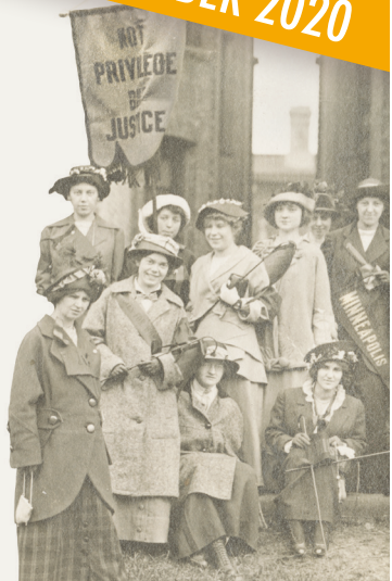
EXHIBIT OPENS SEPTEMBER 2020