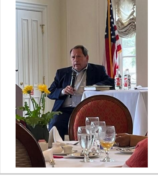
The LWVMI 2025 Convention, May 16-18, 2025, in Grand Rapids, was a great success.

The annual convention was attended by ten LWVOA members. Hosted by the LWV Grand Rapids local league, the event included plenary sessions, informative presentations, and networking opportunities with members from all over Michigan. See the LWVMI website for a complete report of activities and positions approved. Thanks to all members and staff who facilitated this enormous event. HATS OFF for a job well done!