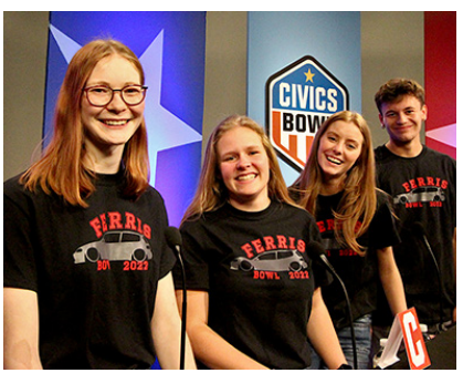
Published August 2022