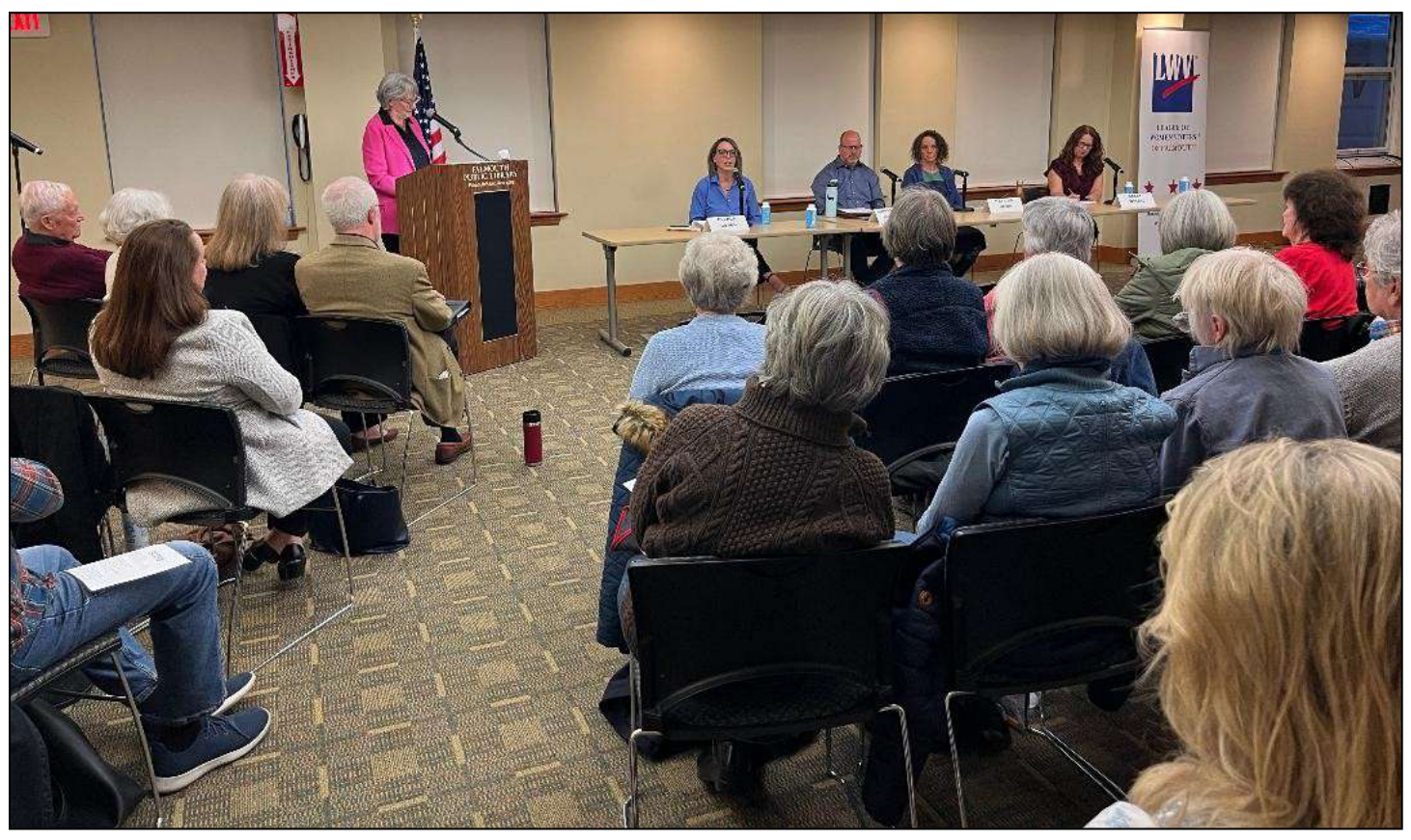
Many interested Falmouth residents attended Candidates Night this year. They had the opportunity to hear candidates answer question and make their positions clear.