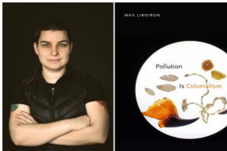
Pollution is Colonialism , by Max Liboiron