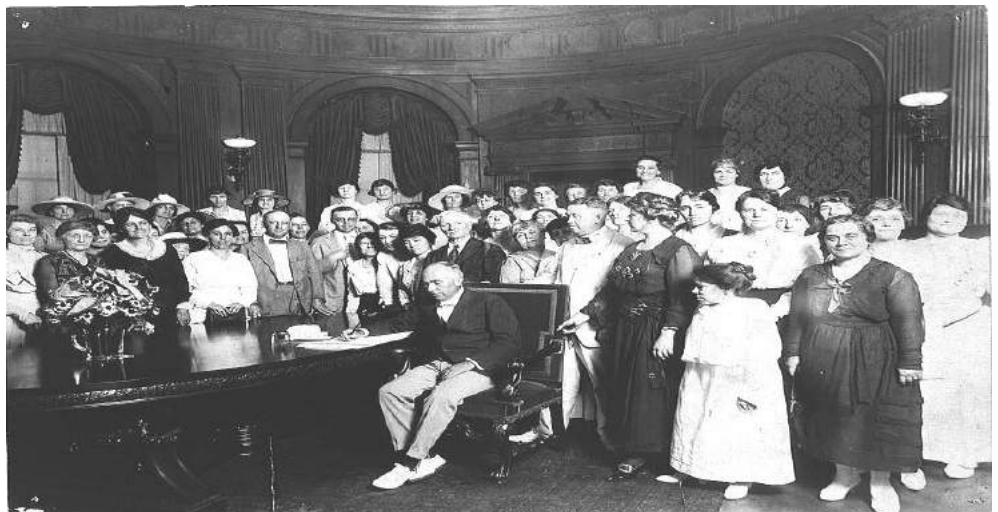
Gov. Frederick D. Gardner signs Missouri's ratification of the federal woman suffrage amendment on July 3, 1919.

Now, therefore be it resolved , that Governor Mike Parson honors those who worked tirelessly to obtain voting rights for all women and encourages all citizens to exercise their hard-fought right to participate in our political system.