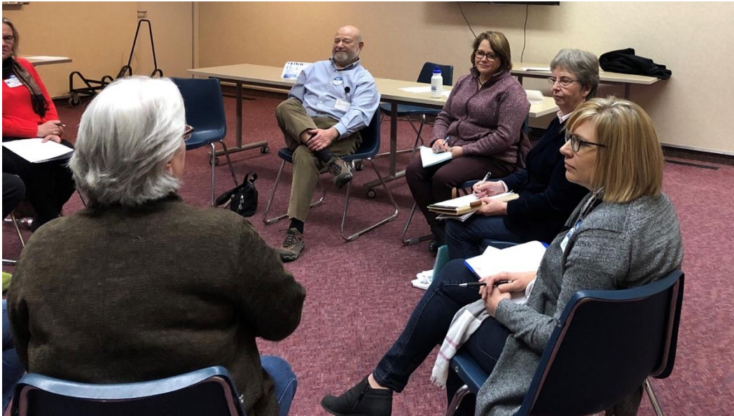
Fridley roundtable needed no table at all– just good conversation.