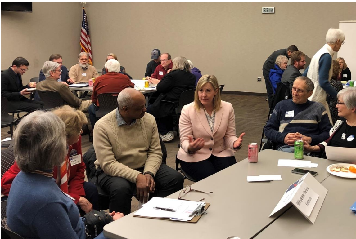
In the middle of interviews at Ramsey.