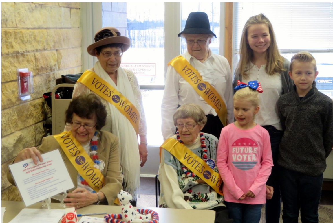
Voters now and into the future