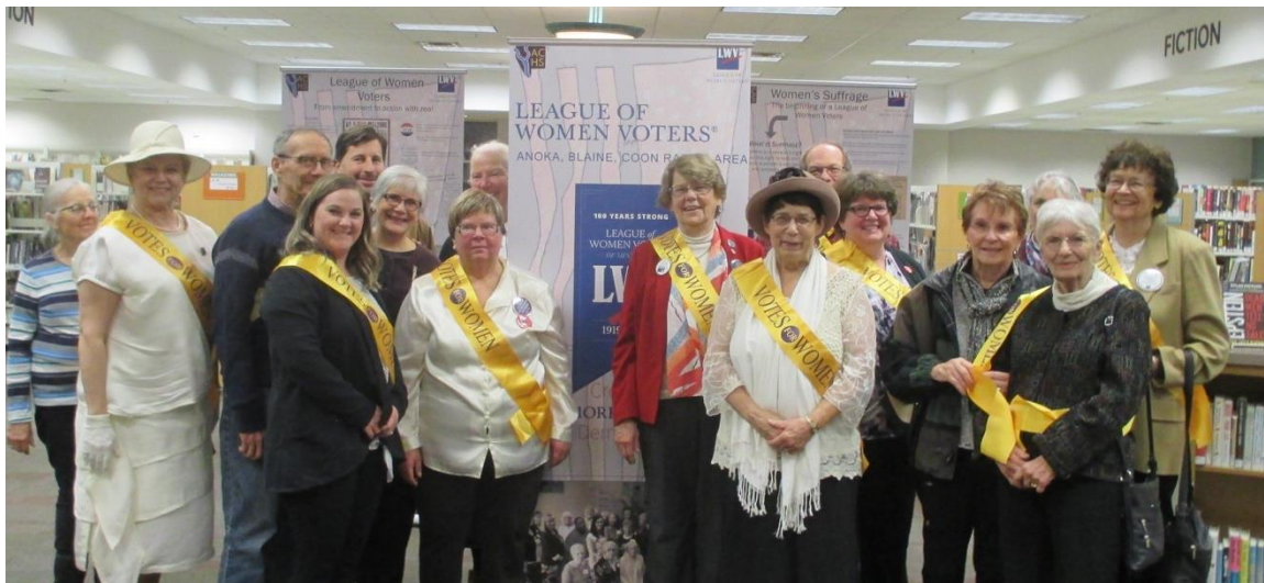
Votes for Women!

Photos from 100th Anniversary Exhibits at Northtown and Rum River Libraries