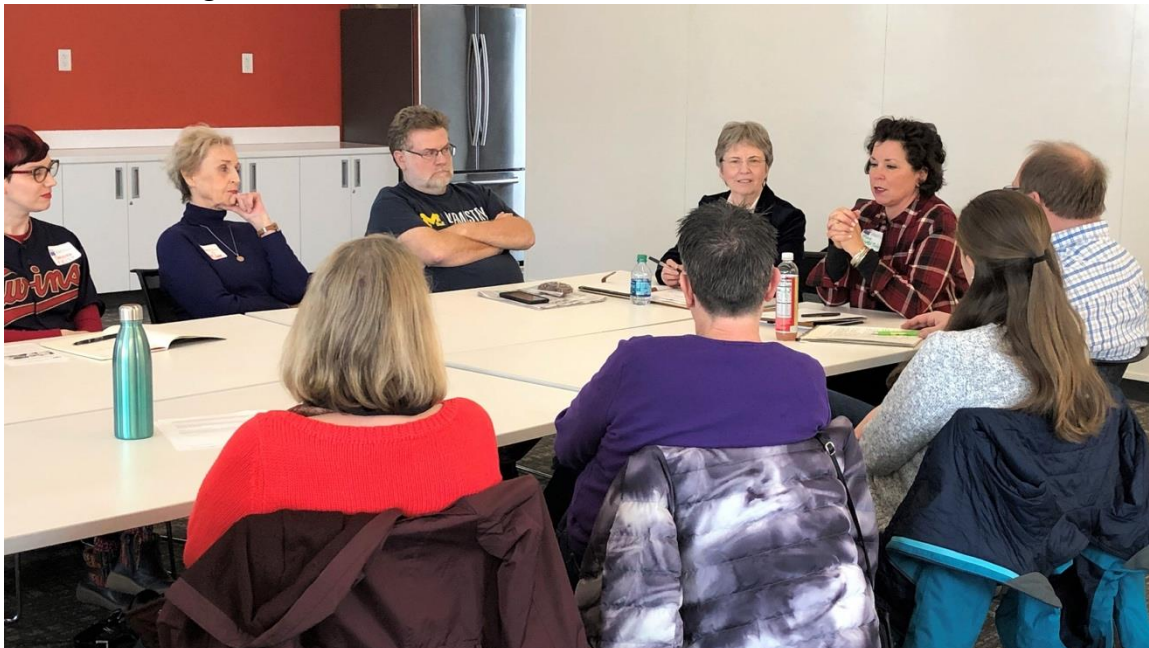
Columbia Heights session – roundtables can happen with rectangular tables, too.