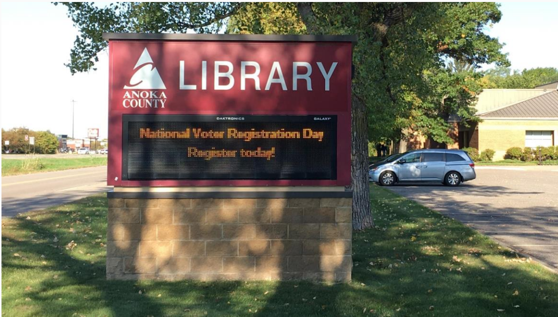
Northtown Library National Voter Registration Billboard, 2021