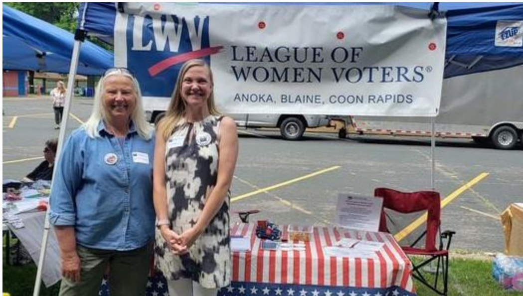
Tower Days Voter Registration 2022