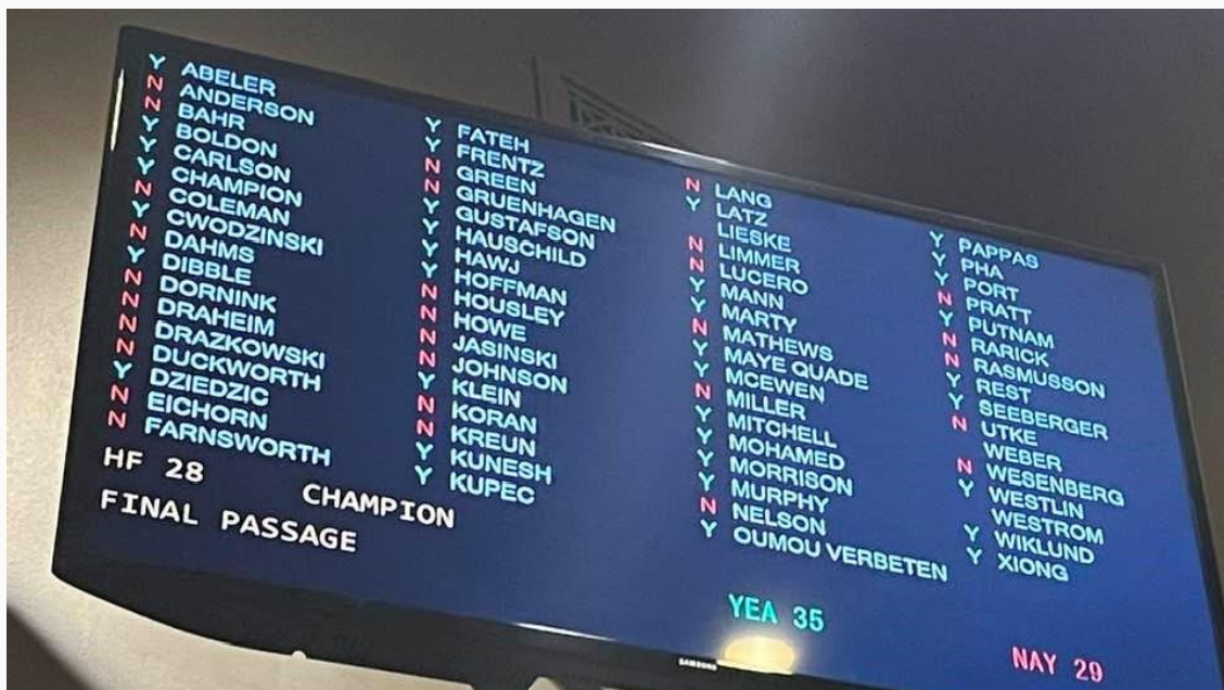
Legislative votes for HF28 - Restore the Vote.

Submit Questions for School Board Candidates