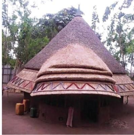
These photos of Nyakade Tot and a family member's home are featured in the ACHS online exhibit.